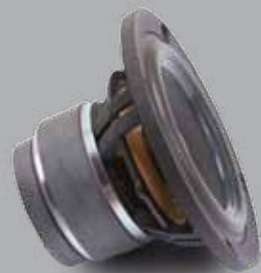
The 4" mid driver with long life foam surround for midrange clarity

Riva combines the 1" wide surround silk dome diaphragm tweeter, a 4" proprietary natural fibre cone and a 7" sliced paper cone, in a 12 layer beach wood form pressed veneer with multiple internal stiffeners. Meticulously tuned crossovers ensure seamless transitions for the best possible response right across the frequency range. The inclined positioning of the baffle facilitates its positioning in all environments, and always ensures an excellent listening experience. The front reflex conduct furthermore makes it easy to place in the listening environment by avoiding unwanted reflection with the rear wall.