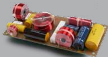
Finely tuned 3 way cross over