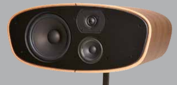
The grille (cloth removed) is an integral part of the design and smooths the baffle to improve high frequency radiation