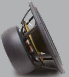
8" optimally vented long-throw bass driver

The fluid shape has not just been an aesthetic choice. The low and wide cabinet mounted on the 25mm solid steel stand gives a more balanced in-room response than the popular tower shaped speaker cabinet. Placed in the mirror imaged left and right cabinet are the 8" hard paper cone woofer with Symmetrical Drive magnet system, 4" proprietary natural fibre cone mid driver and 1" wide surround silk dome tweeter. The 16 layer inert cabinet, hand crafted in Denmark with specially molded wood panels with specially molded wood panels is ported at the rear with aerodynamically shaped in and outlets.